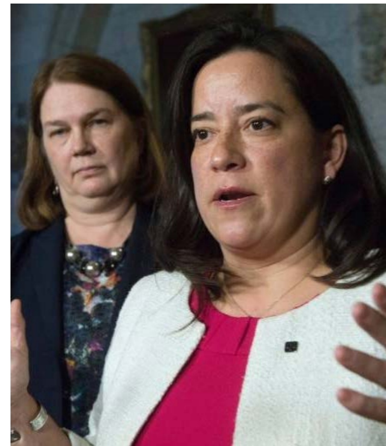
JODY WILSON-RAYBOULD, MINISTER OF JUSTICE