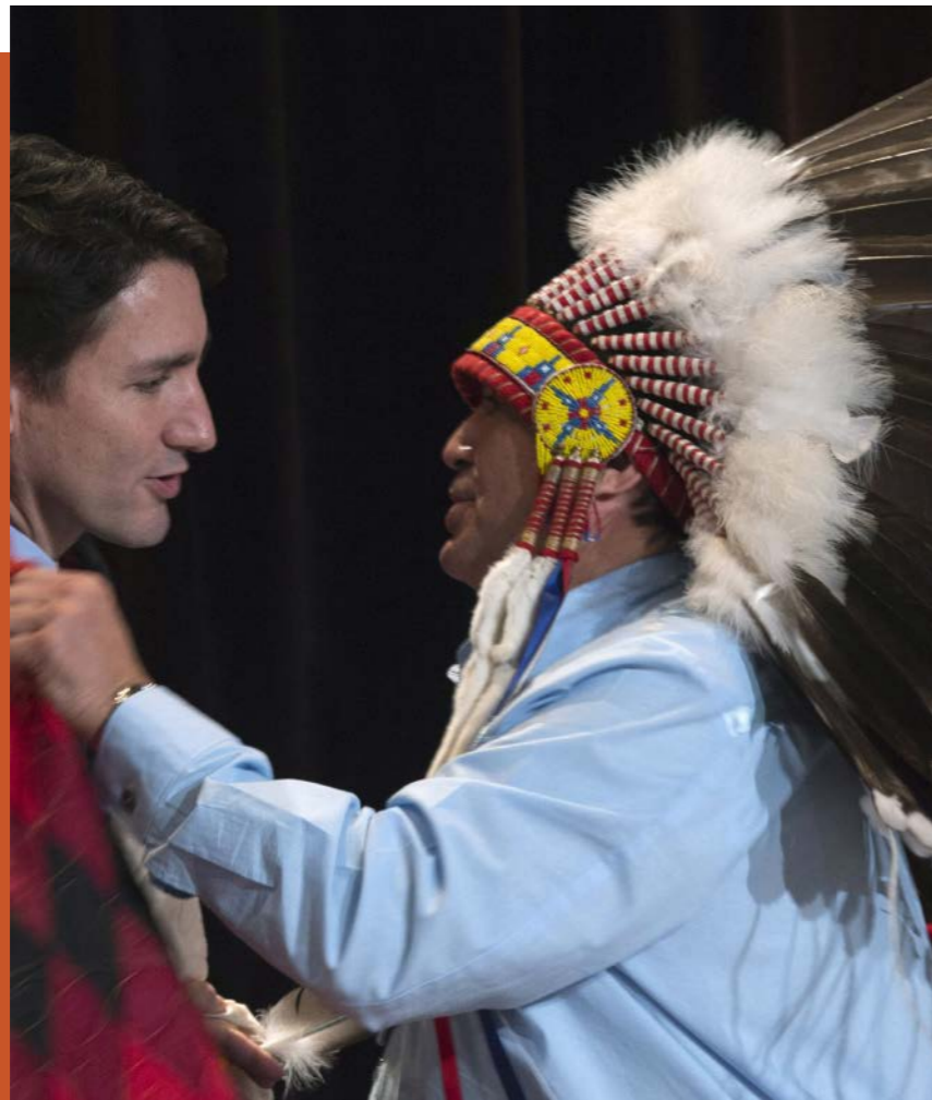
JUSTIN TRUDEAU, PRIME MINISTER AND AFN NATIONAL CHIEF PERRY BELLEGARDE