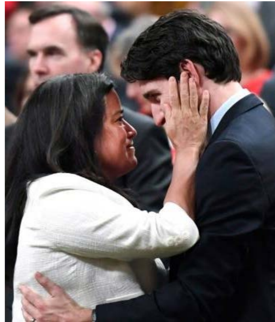
JODY WILSON-RAYBOULD, MINISTER OF JUSTICE and JUSTIN TRUDEAU, PRIME MINISTER