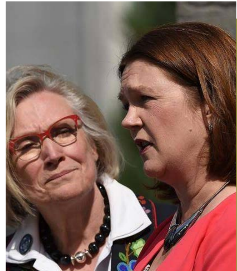
CAROLYN BENNET, MINISTER OF CROWN-INDIGENOUS RELATIONS AND NORTHERN AFFIARS AND JANE PHILPOTT, MINISTER OF INDIGENOUS SERVICES